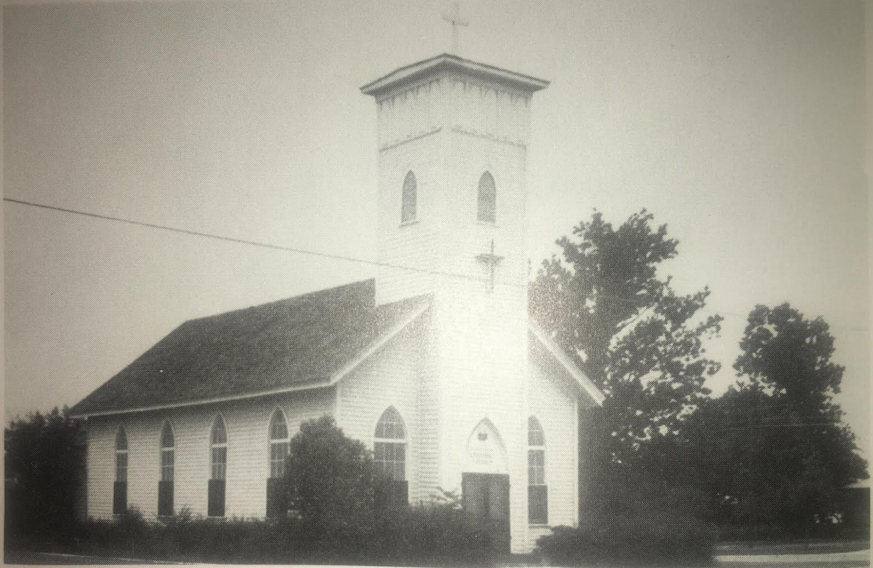
St. Bartholomews Episcopal Church, built in Hempstead, Texas 1870.