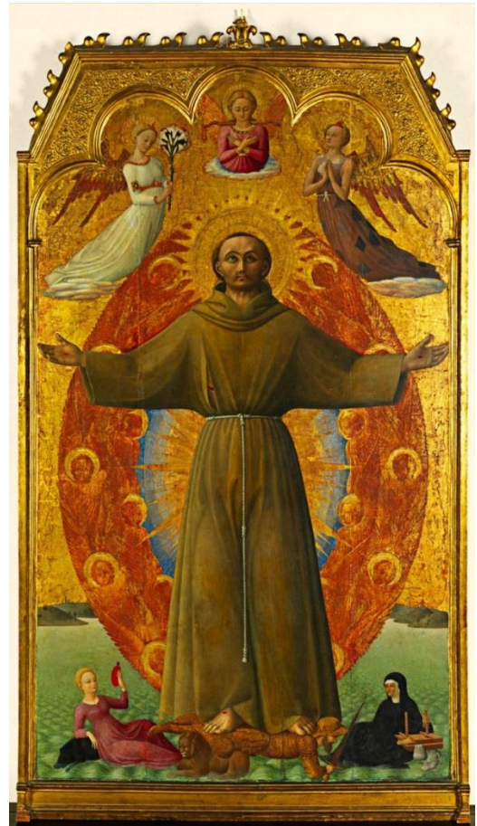
Image of St. Francis of Assisi found online http://www.newyorker.com/magazine/2013/01/14/rich-man-poor-man